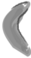
A sickle-shaped red blood cell of sickle cell disease

SCD is therefore a group of conditions that cause red cells to become sickle-shaped.