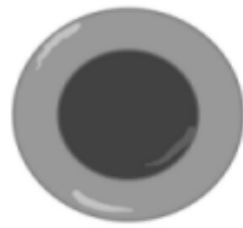
Normal red blood cell (which is shaped a bit like a doughnut)